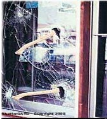
ShatterGARD makes glass highly impact resistant